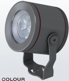
Metal Black COLOUR