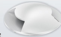
DORI MINI V2