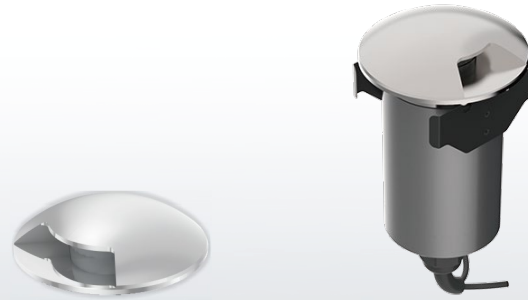
DORI MINI V1