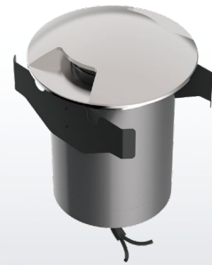
DORI Maxi V2