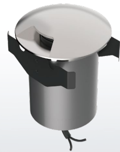
DORI Maxi V1